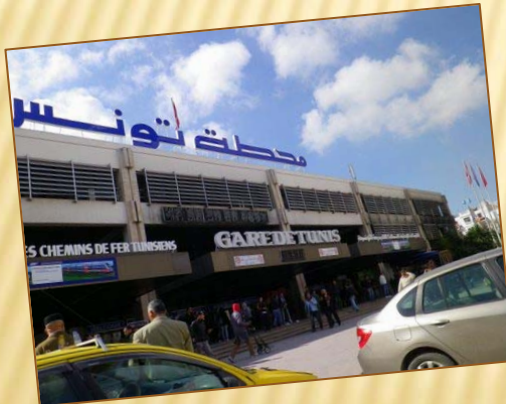
Tunis Railway station (B)