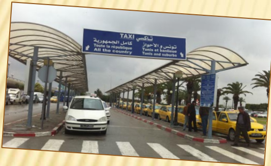
Station of yellow taxis and touristic taxi (white) at the Tunis Carthage Airport (A)

Route: Tunis Carthage Airport (A) – Tunis Railway station (B) - Bab Alioua louages Station (C). interval 11Km about 20 min.