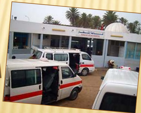
Bab Alioua louages Station (C)